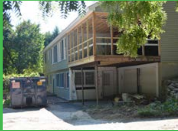
Powers House