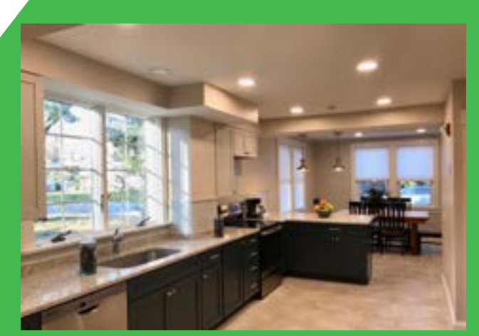
Emerson House

Another exciting addition to Minute Man Arc's residential program is the opening of a new group home in Sudbury , slated for the fall of 2020. The five-bedroom, single level home is in a lovely residential neighborhood. The expansive layout has been totally renovated and there is a screened porch overlooking a large, landscaped yard. Through an agreement through a local partnership, the home will be given to Minute Man Arc, debt-free, in 30 years.